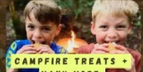
CAMPFIRE TREATS + MANY MORE