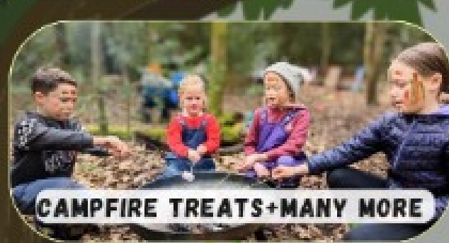
CAMPFIRE TREATS+MANY MORE

HURRY DISCOUNT OFFER EXPIRES FRIDAY 19TH MAY