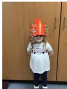
Emmie-Rose H Nursery