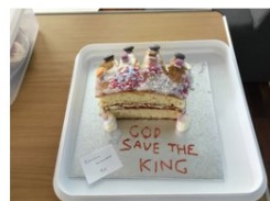
Emily W 3A