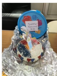
Summer B 4A